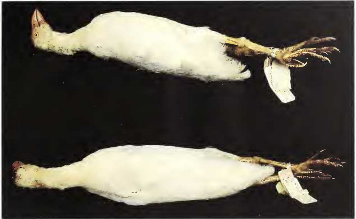
Figure 12. Lateral (top) and dorsal views of the specimen at the Naturhistorisches Museum Wien (NMW 50761), probably collected March 1788 on Lord Howe Island, the type specimen of Porphyrio alba (White, 1790)

by Keulemans, is identical in pose to the Liverpool mount. So either Forbes was in error, or the specimen has been remade (again) since Forbes, based on the plate in Rowley. Sarah Stone's illustration of the Vienna bird was probably derived from the original pose of the mounted specimen, rather than the specimen being modelled on her painting; the skin is now demounted with legs outstretched (Fig. 12).